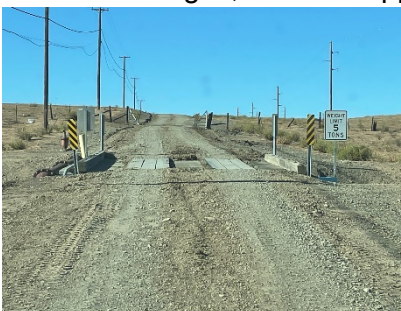
No Chipseal required