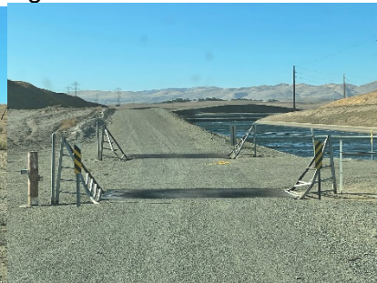
Chipseal Required (14'&12' Wide Cattle Guards)